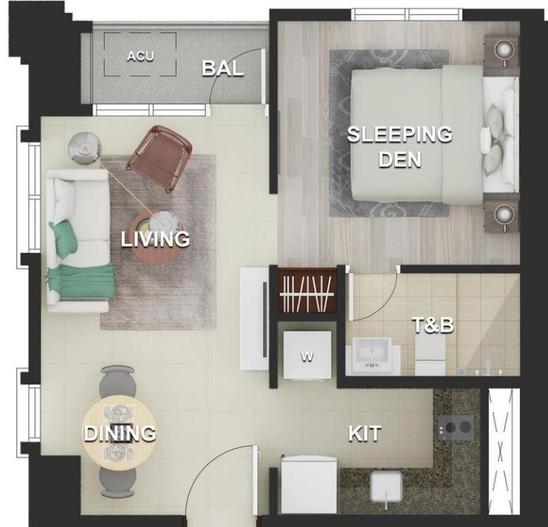
TYPICAL 5TH-15TH, 17TH-18TH FLOOR UNIT A, F TYPICAL 19TH-20TH FLOOR UNIT A, D EXECUTIVE STUDIO AREA = 37.50 SQ.M.+ 2.50 SQ.M. BAL

All units are unfurnished. The appliances and other details indicated in the plans are for illustration purposes only and not included in the sale. Selling price is established principally on a per unit basis and not on the unit measurement or dimension. Sizes and location of structural elements and utility pipe chases are subject to change and may differ from actual deliverable condition.