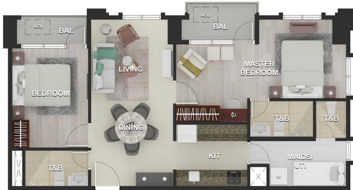
TYPICAL 5TH-15TH FLOOR UNIT G, L 2 BEDROOM UNIT AREA = 73.50 SQ.M.+ 6.00 SQ.M. BAL

All units are unfurnished. The appliances and other details indicated in the plans are for illustration purposes only and not included in the sale. Selling price is established principally on a per unit basis and not on the unit measurement or dimension. Sizes and location of structural elements and utility pipe chases are subject to change and may differ from actual deliverable condition.