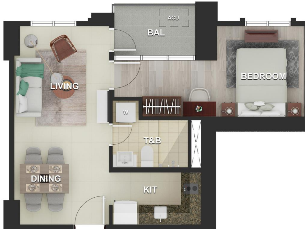
18TH FLOOR UNIT C, D 1 BEDROOM UNIT AREA = 43.50 SQ.M.+ 4.00 SQ.M. BAL

All units are unfurnished. The appliances and other details indicated in the plans are for illustration purposes only and not included in the sale. Selling price is established principally on a per unit basis and not on the unit measurement or dimension. Sizes and location of structural elements and utility pipe chases are subject to change and may differ from actual deliverable condition.