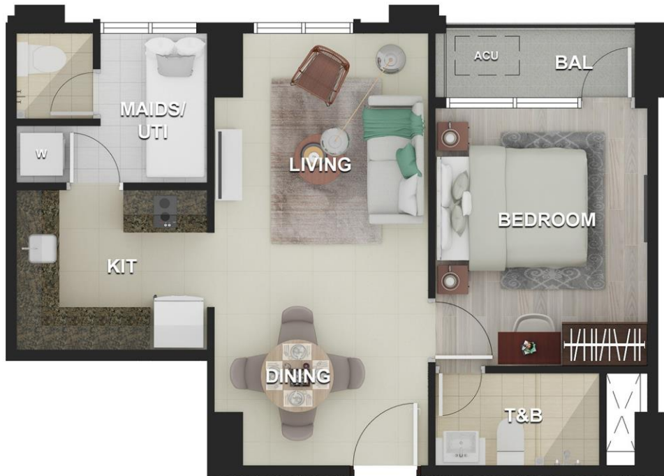
TYPICAL 5TH-18TH FLOOR UNIT B, E EXECUTIVE 1 BEDROOM UNIT AREA = 50.50 SQ.M.+ 2.50 SQ.M. BAL

All units are unfurnished. The appliances and other details indicated in the plans are for illustration purposes only and not included in the sale. Selling price is established principally on a per unit basis and not on the unit measurement or dimension. Sizes and location of structural elements and utility pipe chases are subject to change and may differ from actual deliverable condition.