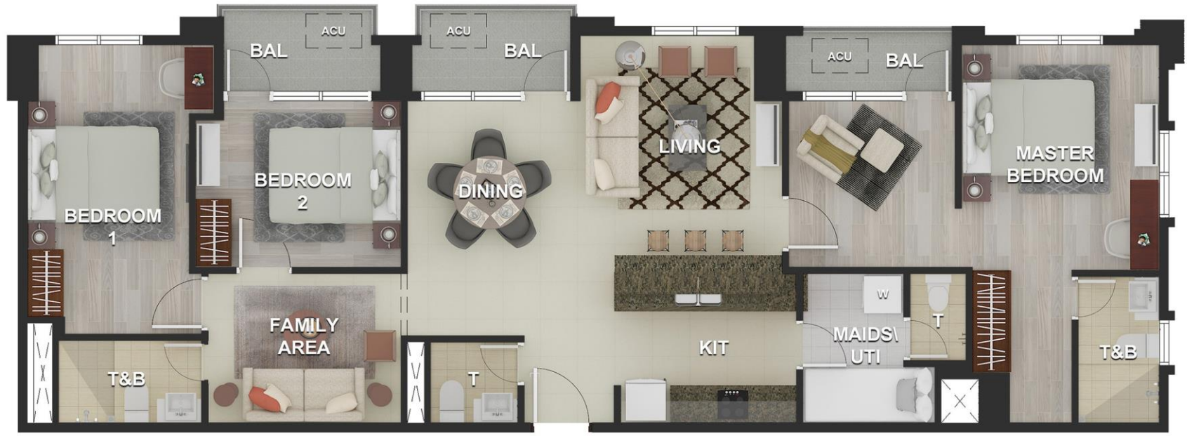
TYPICAL 19TH-20TH FLOOR UNIT E, H 3 BEDROOM UNIT AREA = 110.00 SQ.M.+ 9.50 SQ.M. BAL

All units are unfurnished. The appliances and other details indicated in the plans are for illustration purposes only and not included in the sale. Selling price is established principally on a per unit basis and not on the unit measurement or dimension. Sizes and location of structural elements and utility pipe chases are subject to change and may differ from actual deliverable condition.