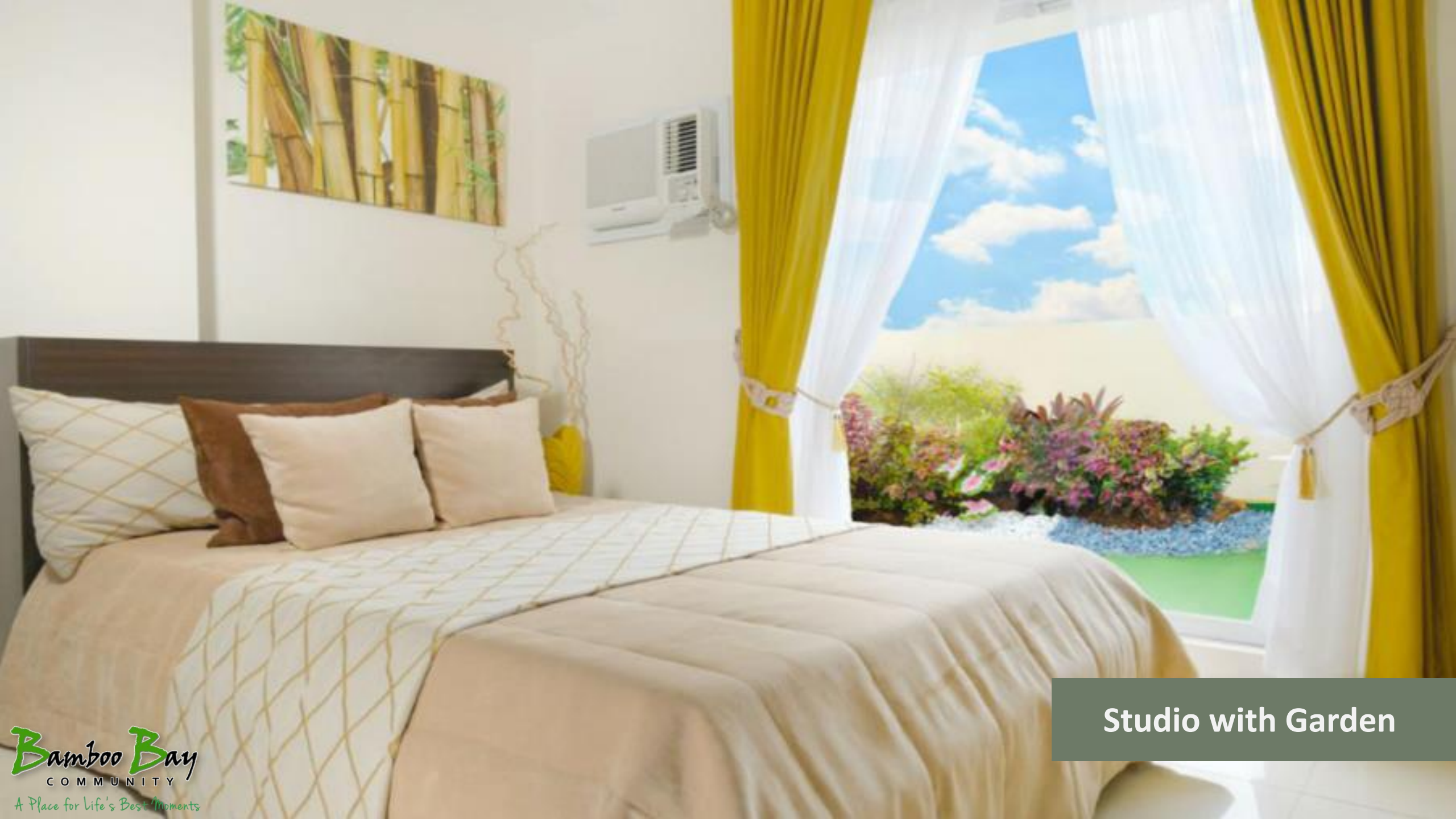
Studio with Garden